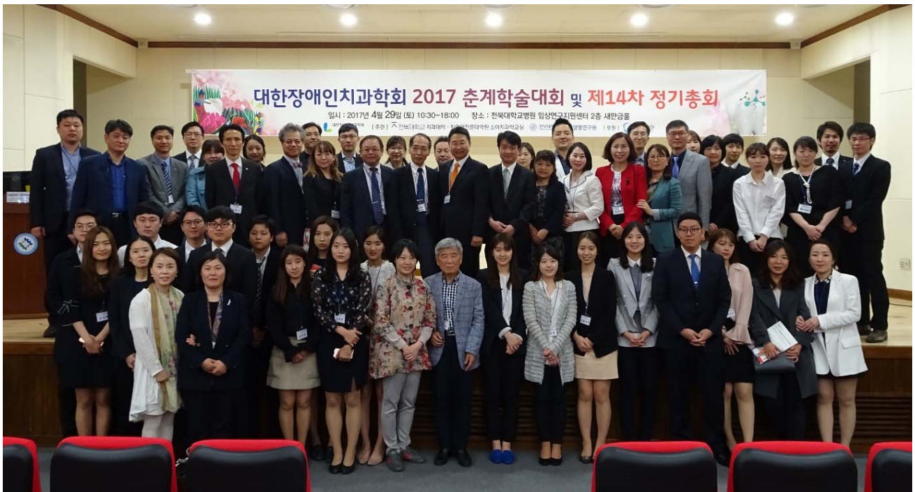
▲ Celebratory photography